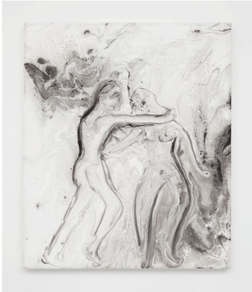
Alison Veit Josephine 2015 ink and hydrocol on canvas 19 x 16 inches