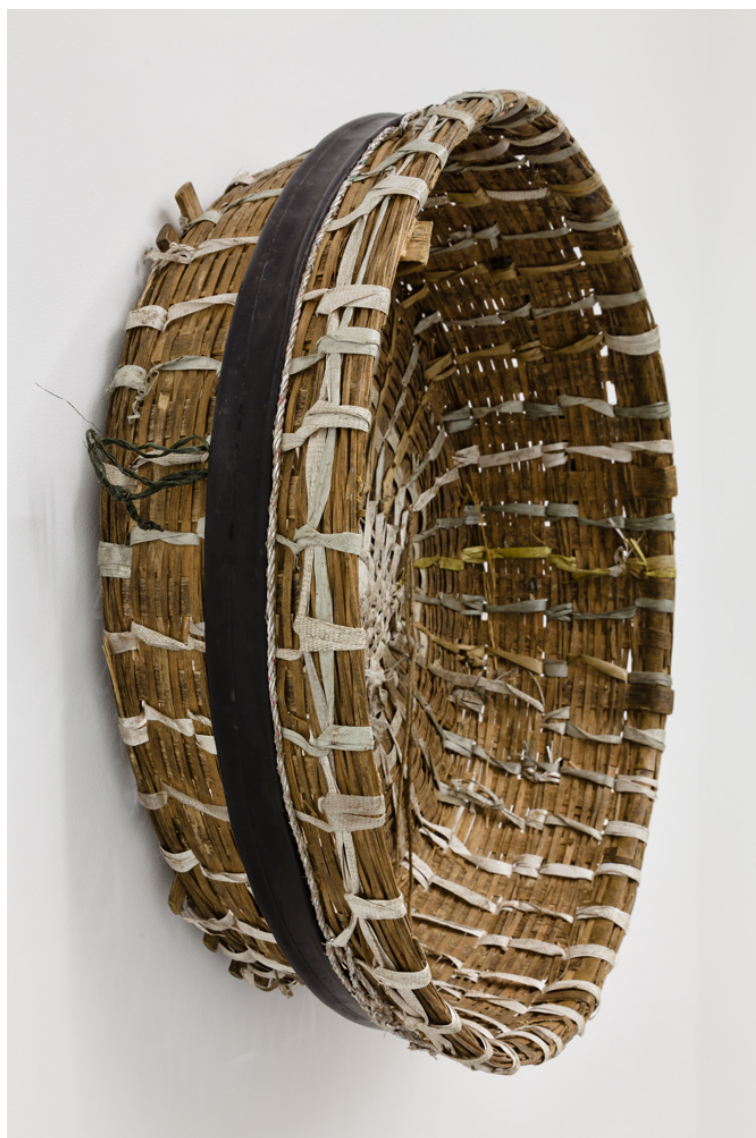
SEBASTIAN LLOYD REES Untitled (Crawford Market) 2015 found object 29 x 28 x 8.5 inches