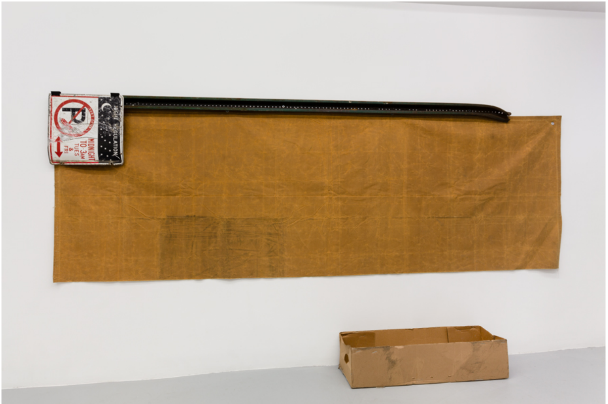
SEBASTIAN LLOYD REES Untitled (Crawford Market) 2015 tarpaulin, metal, cardboard dimensions variable