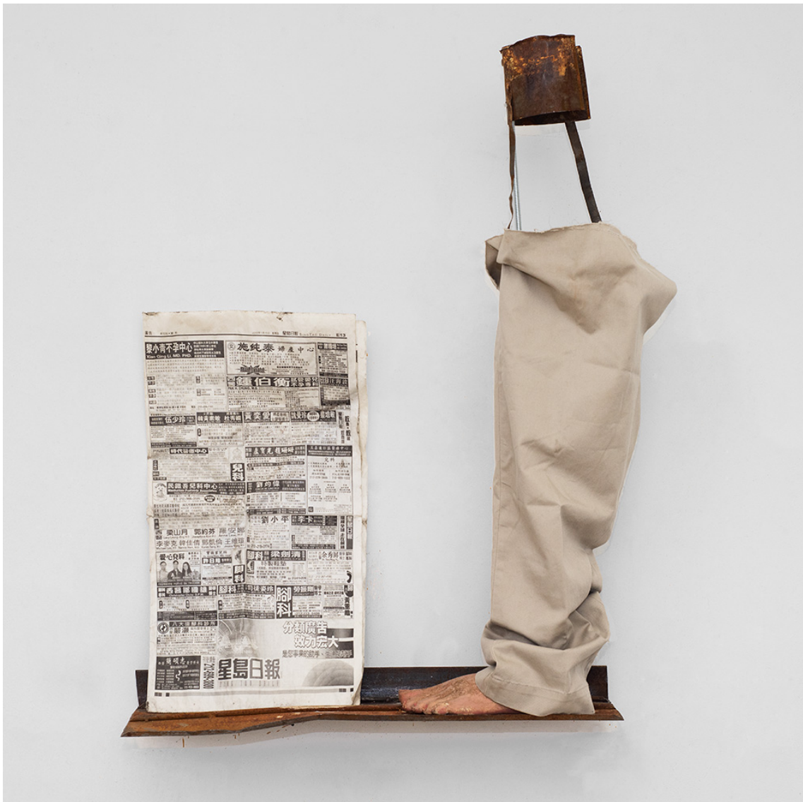
SEBASTIAN LLOYD REES Untitled 2015 metal, found object, newspaper, fabric 35.5 x 27 x 8.5 inches