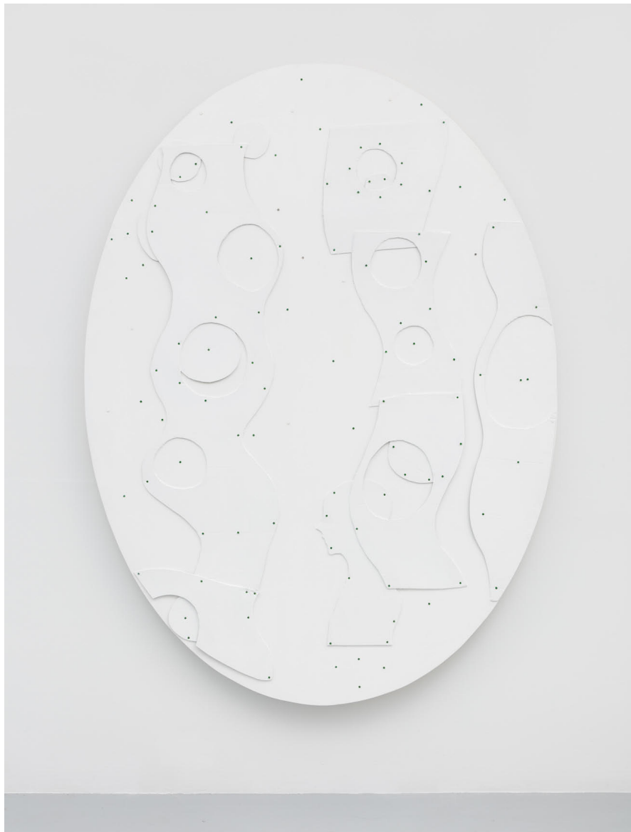
DARIO GUCCIO Una giornata moderna 2016 acrylic, cardboard, wood panel, nails 69 x 49 inches