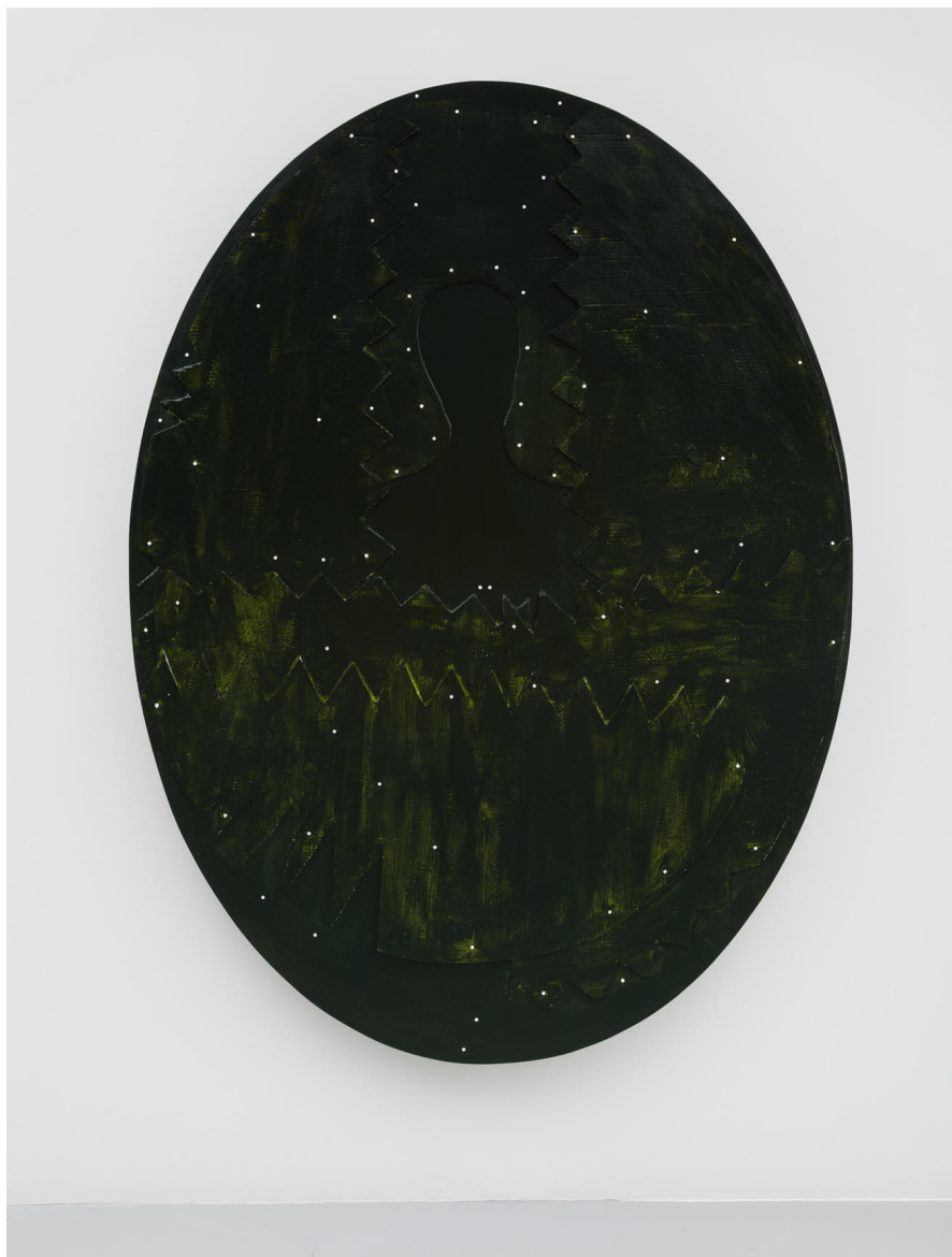
DARIO GUCCIO Perso nel giardino di casa 2016 acrylic, cardboard, wood panel, nails 69 x 49 inches